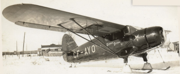
CF-AYO, converted to skis, and painted in the colours of its first owner, Dominion Skyways. Photo taken at Cartierville on Jan 8, 1936.