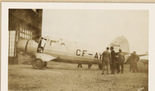
CF-AYO on November 11, stripped of wings and floats and ready to leave Cartierville for the test flights at Pointe Aux Trembles.

Newest addition to Skylines Express Limited's fleet of passenger planes for northern Quebec and Ontario service. The Norseman CF-BDF, made its maiden trip from Montreal to Kirkland and intermediate points yesterday, with a cabin-load of newspapermen. The sleek silver-grey seaplane is shown above at Longueuil, Que. The new nine-seater went into commercial service between Montreal and Val d'Or, Rouyn and Kirkland Lake this morning. The plane was designed and constructed by Noorduyn Aircraft Ltd., at St. Laurent, Que.